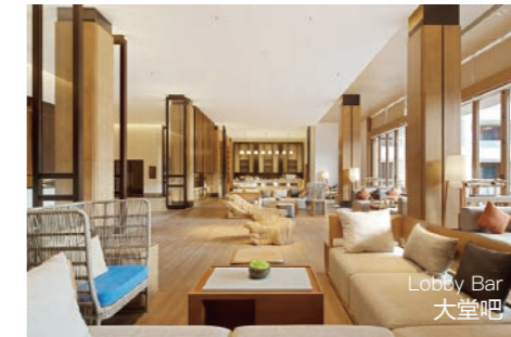
Lobby Bar 大堂吧