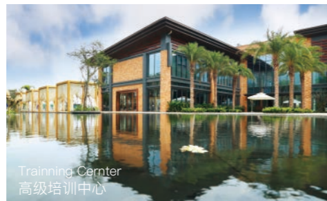
Training Center 高级培训中心