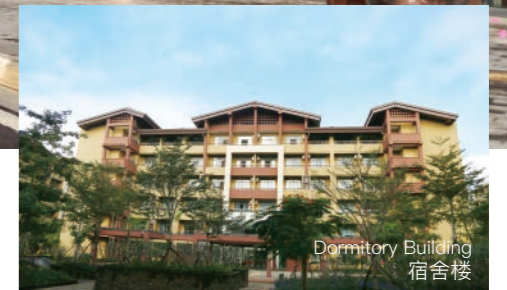
Dormitory Building 宿舍楼