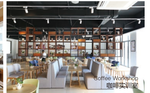
Coffee Workshop 咖啡实训室