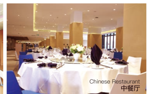
Chinese Restaurant 中餐厅