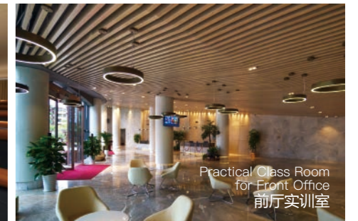
Practical Class Room for Front Office 前厅实训室