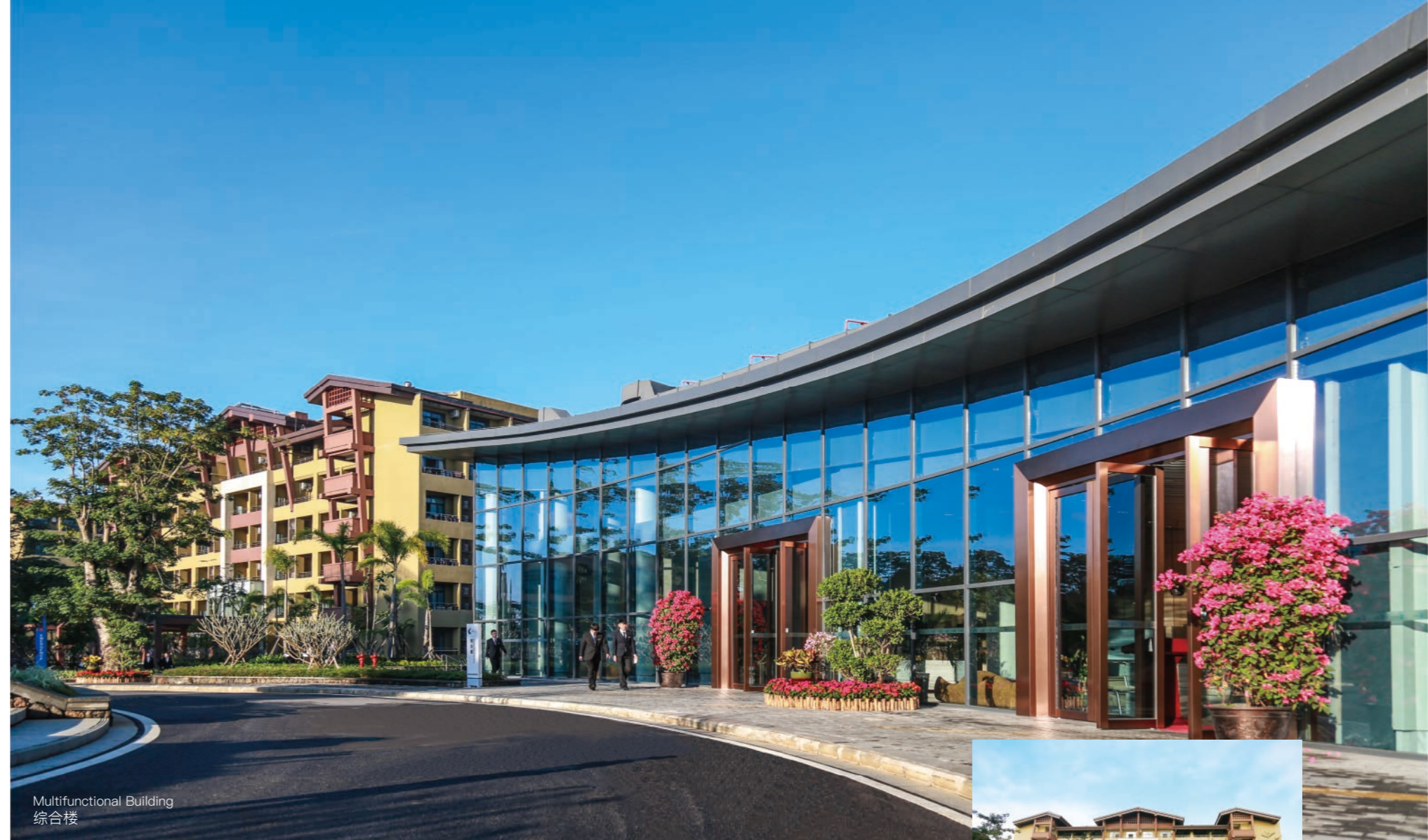
Multifunctional Building 综合楼

Hotel-Standard Quad Room: Private Washroom with Shower, Balcony, Air Conditioning, Hot Water 四人间酒店式学生公寓：独立卫生间、阳台、空调、热水