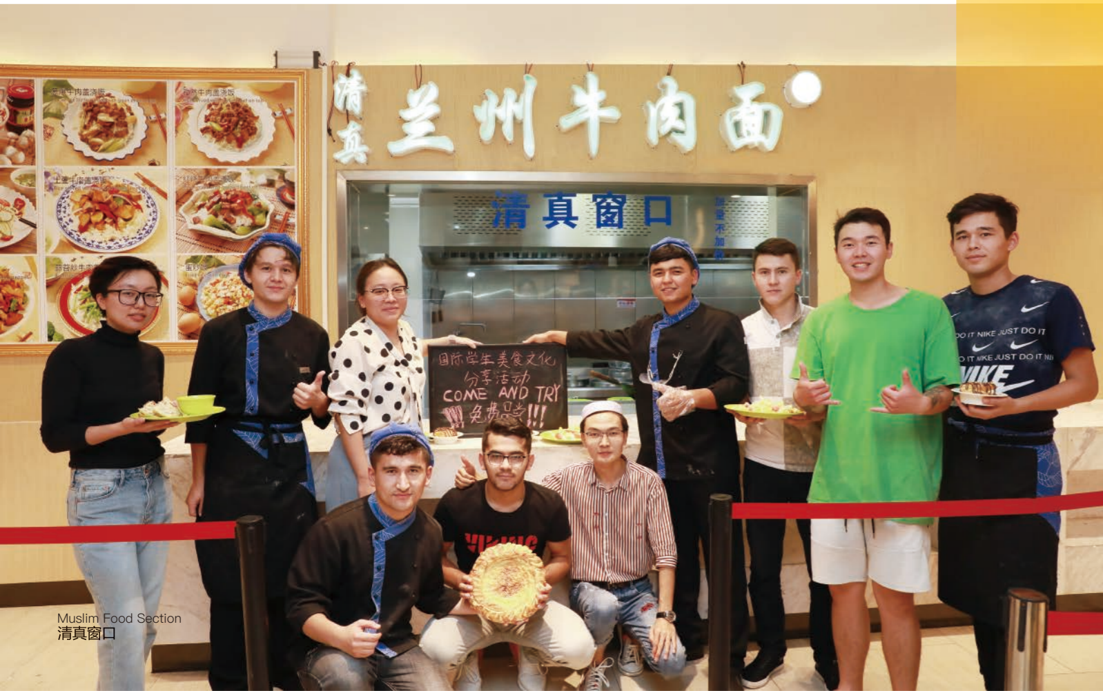
Muslim Food Section 清真窗口

我们不只希望你在这里体验汉语学习的乐趣，还希望你在这里收获更多的友谊，感受中国文化的魅力。