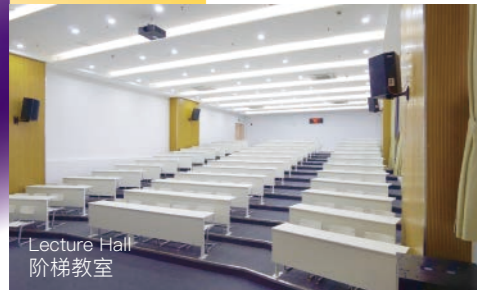
Lecture Hall 阶梯教室