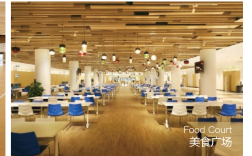
Food Court 美食广场