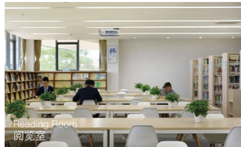
Reading Room 阅览室